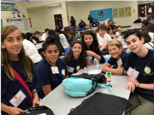
NJHS Middle School Leadership Conference

If you are interested in enrolling your child for before or after care, please contact our staff at 954-552-7857.